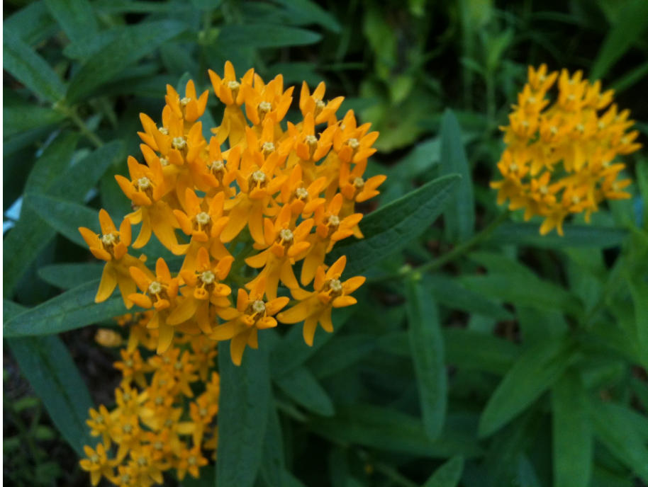
Asclepias in my garden

I want to be a seed that germinates best after the freeze, thaw, freeze, thaw cycle.